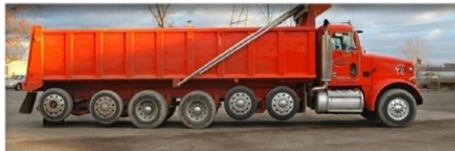
SU7 – 38.75 Ton