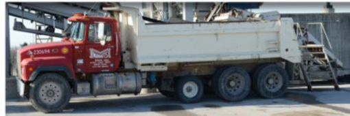
SU4 – 27 Ton