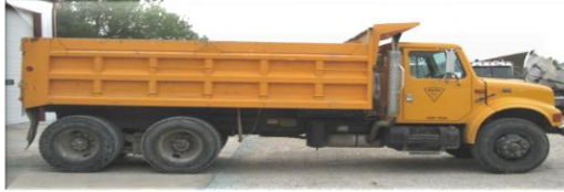
NE Type 3 – 25 Ton