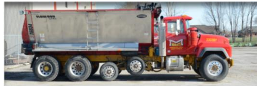
SU5 – 31 Ton