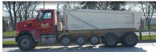
SU6 – 34.75 Ton